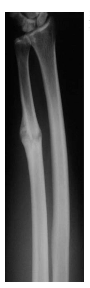
Figure 2 - Forty-five days after ESWT, the radius radiography image shows the complete bone consolidation.